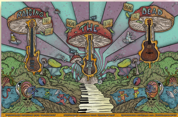
New Year's Eve Run 2023 Poster by @beepboopbopart