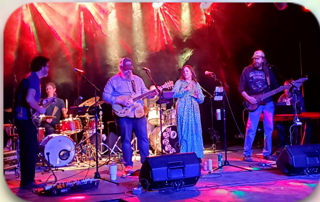
The Tangent Gallery, 2022