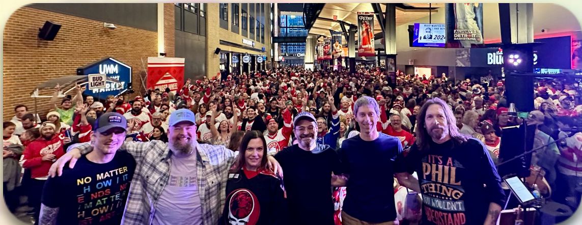
Little Caesars Arena, Red Wings Grateful Dead Night, 2024

With a full audio and video production team, Raising The Dead will put on an incredible, psychedelic tribute performance your patrons will love.