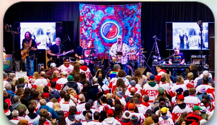
Red Wings Dead Night 2024