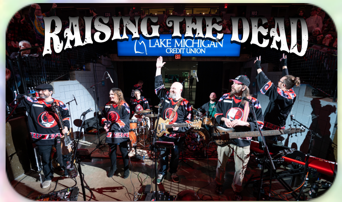
Van Andel Arena, Grand Rapids 2023

From Lake Michigan to the Detroit River, Raising The Dead is Michigan's premiere Grateful Dead tribute - an ensemble of professional musicians recreating the energy, harmony, and intricate arrangements of the original jam band. The music spans styles including country western, blues, rock, R & B, and bluegrass, accented by covers of Bob Dylan, The Beatles, The Rolling Stones, Chuck Berry, Merle Haggard, The Band and more.