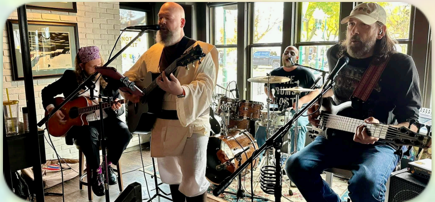
The Sardine Room, Halloween 2023