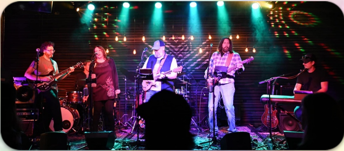
The Parliament Room at Otus Supply, December 2022