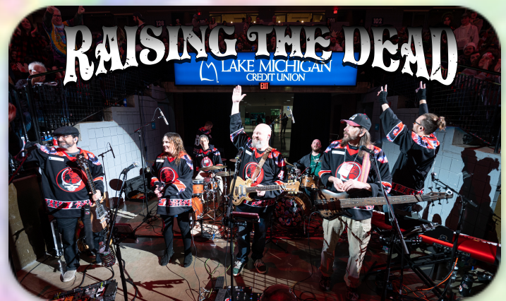
Van Andel Arena, Grand Rapids 2023

Deadheads are everywhere, and they can't wait for the next show. Because they know each one will be different, they keep coming to see Raising The Dead, night after night.