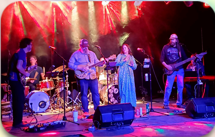
The Tangent Gallery, 2022