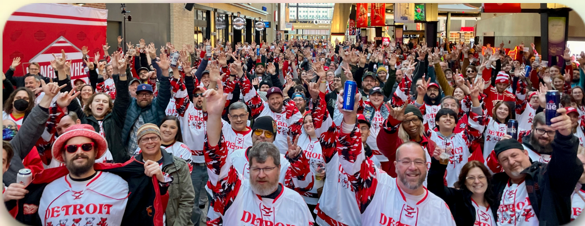
Little Caesars Arena, Red Wings Grateful Dead Night, 2023