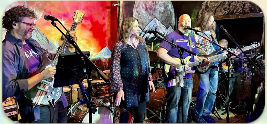
The Rumpus Room in Chelsea, 2022