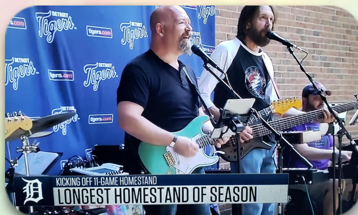
Live on WDIV from Comerica Park, 2019